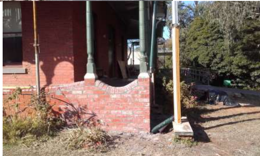
New brickwork — nearly finished!

Rejoicing in God; Father, Son and Holy Spirit, we dedicate ourselves to worship, spiritual formation and pastoral care within the church community, local community and the world.